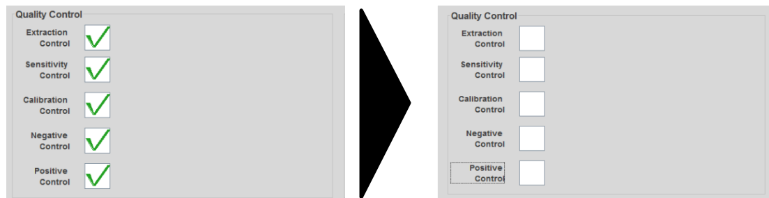
Figure 2: Plate setup window of the Modaplex software. Left: Quality control fields with ticks; Right: Quality control fields without ticks

Note: Remove all quality-control ticks in the plate setup window as no absolute quantification is taking place.